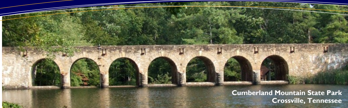
Cumberland Mountain State Park Crossville, Tennessee